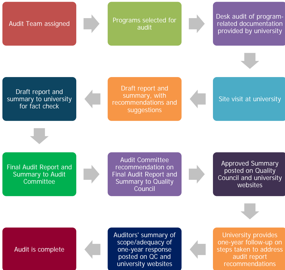
Chart 4: Audit Process Overview